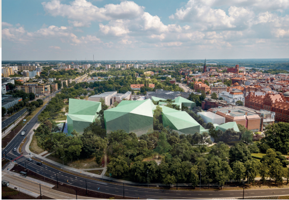
CAMERIMAGE EUROPEAN FILM CENTRE IN TORUŃ RENDERING JD 105