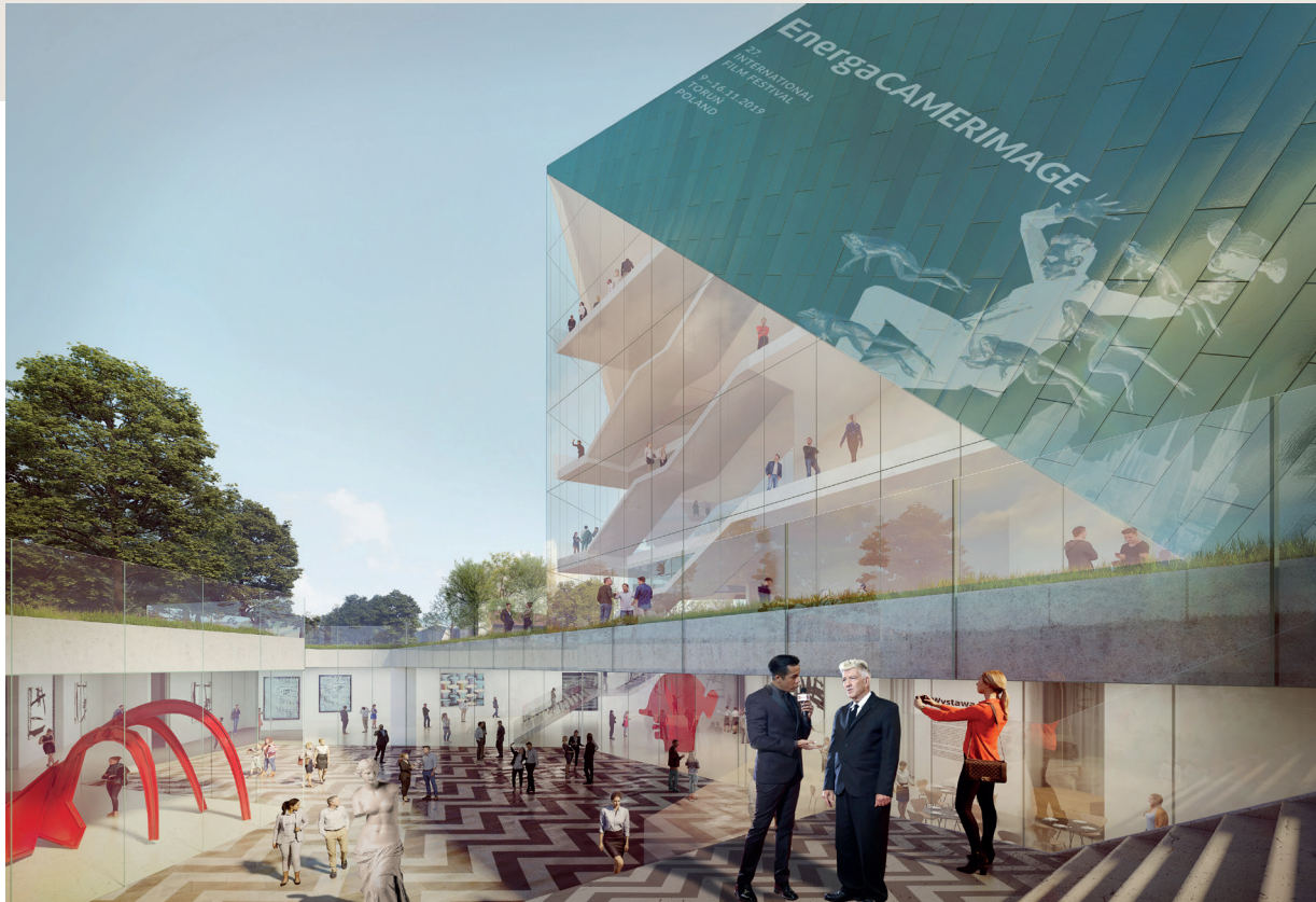
CAMERIMAGE EUROPEAN FILM CENTRE IN TORUŃ RENDERING JD 116