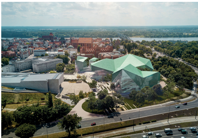
CAMERIMAGE EUROPEAN FILM CENTRE IN TORUŃ RENDERING JD 104