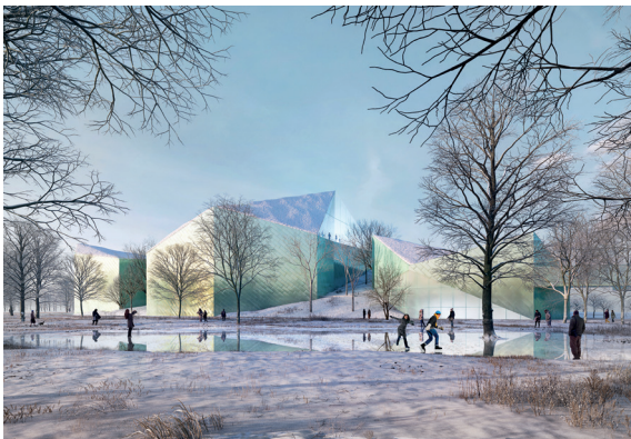
CAMERIMAGE EUROPEAN FILM CENTRE IN TORUŃ RENDERING JD 102