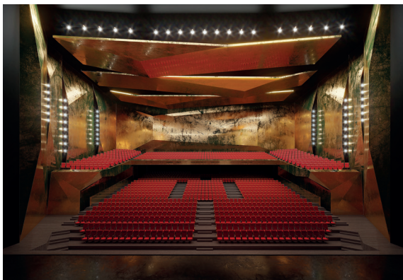
CAMERIMAGE EUROPEAN FILM CENTRE IN TORUŃ RENDERING JD 112