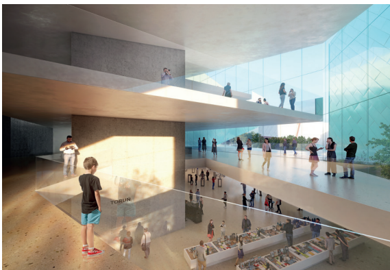
CAMERIMAGE EUROPEAN FILM CENTRE IN TORUŃ RENDERING JD 114