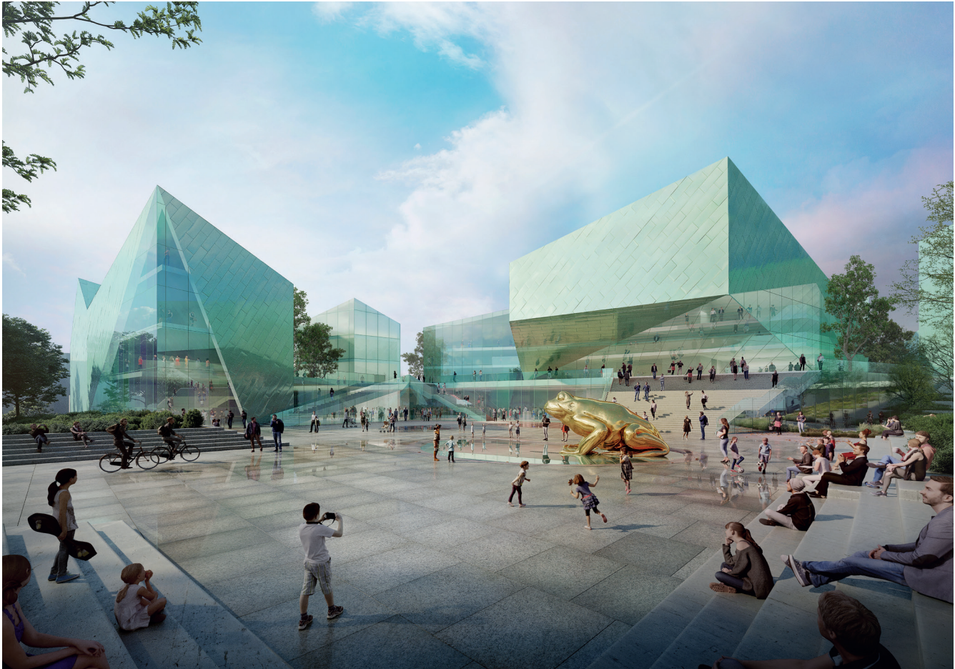
CAMERIMAGE EUROPEAN FILM CENTRE IN TORUŃ RENDERING JD 101