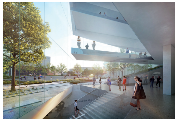
CAMERIMAGE EUROPEAN FILM CENTRE IN TORUŃ RENDERING D 115