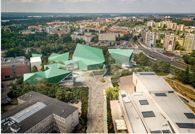
CAMERIMAGE EUROPEAN FILM CENTRE IN TORUŃ RENDERING JD 103